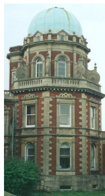
The Orwell Park Observatory Tower