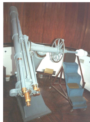
The Tomline Refractor, commissioned in 1874